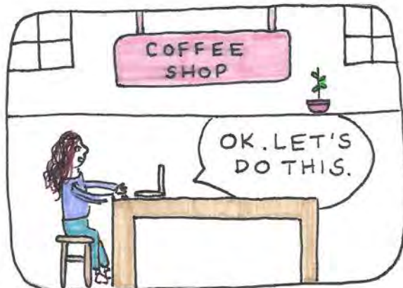
LOUISVILLE, KY MAY 2019