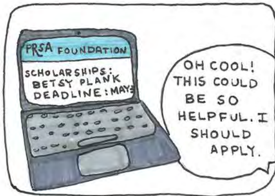
UNIVERSITY OF DAYTON APRIL 2019