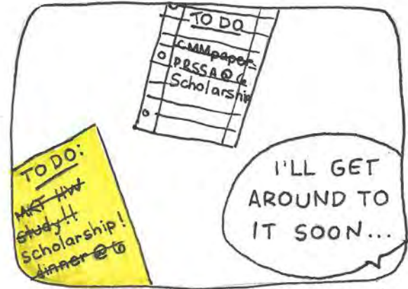
UNIVERSITY OF DAYTON APRIL 2019